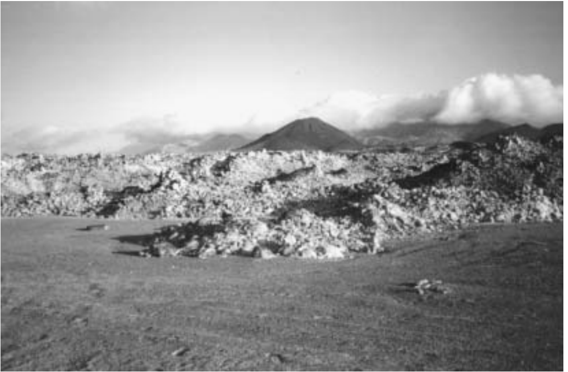
Fig. 2. Northern Ascension Island, showing old guano.

collected further bones. This note deals with the terrestrial species. Sites where bones have been found are shown in Fig. 1, and the records are summarised in Bourne et al. (in press).