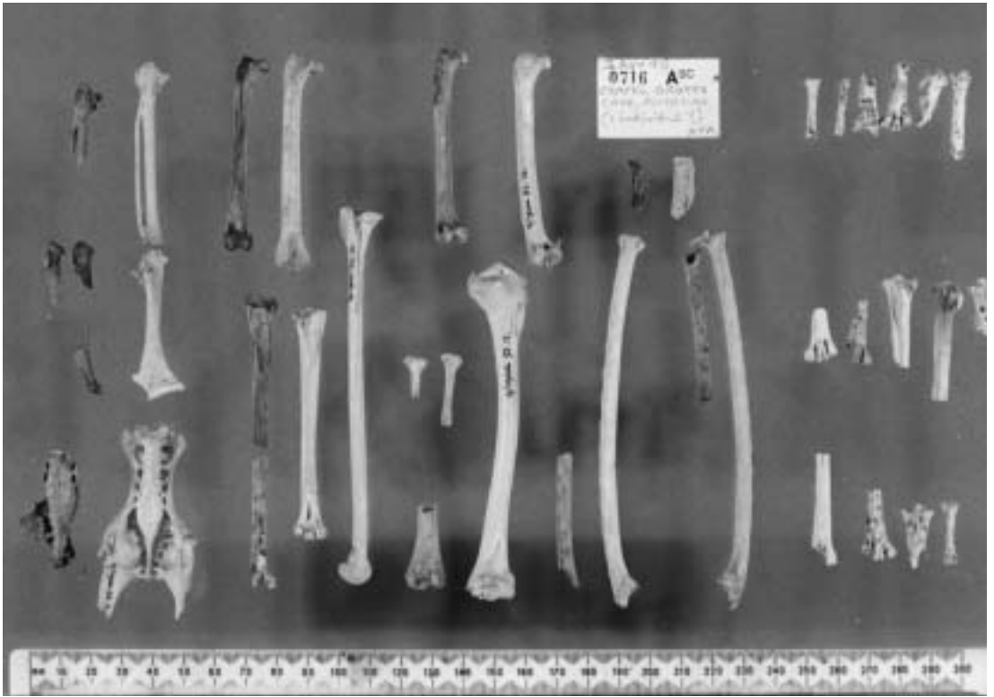
Fig. 3. Bones of Nycticorax olsoni from Chapel Grotto, Ascension. Main series, Natural History Museum specimen S/1999.1.1 on left compared with N. nycticorax on right. Series S/1999.1.10, 13 & 16 down right hand margin.